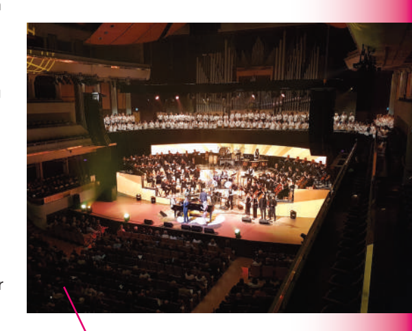
Crescendo fundraiser in the Jack Singer Concert Hall

All of these improvements are just a small glimpse into the moving parts of what goes on behind-the-scenes in the hardworking Arts Commons building.