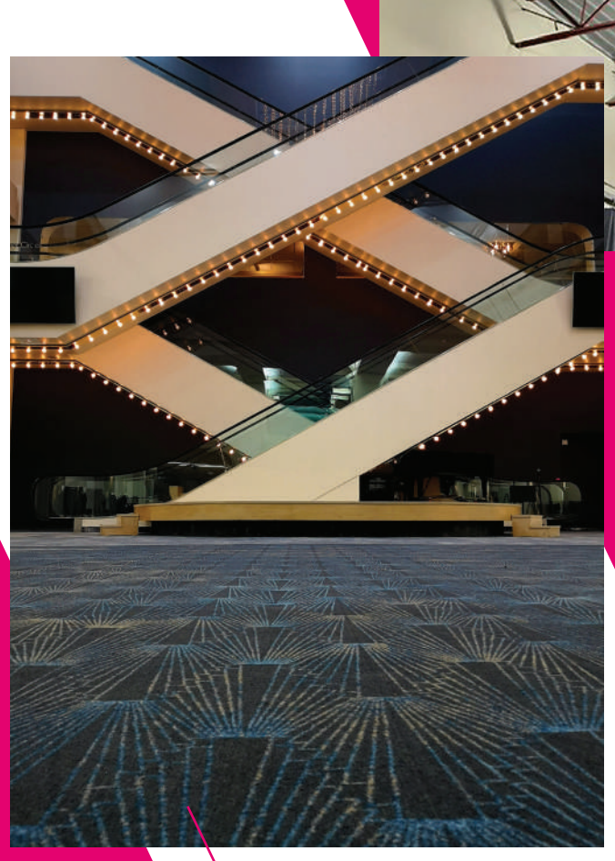
Jack Singer Lobby featuring new carpeting