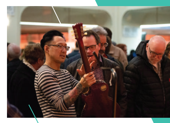
Patrons in the lobby before Classic Albums Live show

people were introduced to Arts Commons Presents performances at no cost, through the TD Arts Access Pass Program