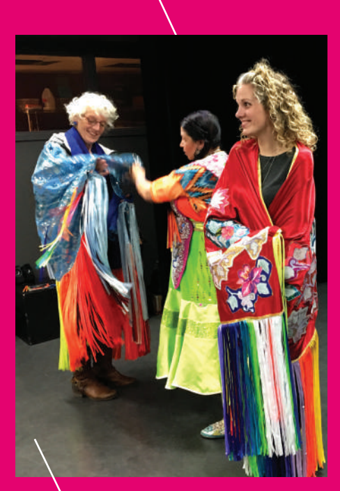
Learning about Indigenous culture during Teacher Professional Development Day