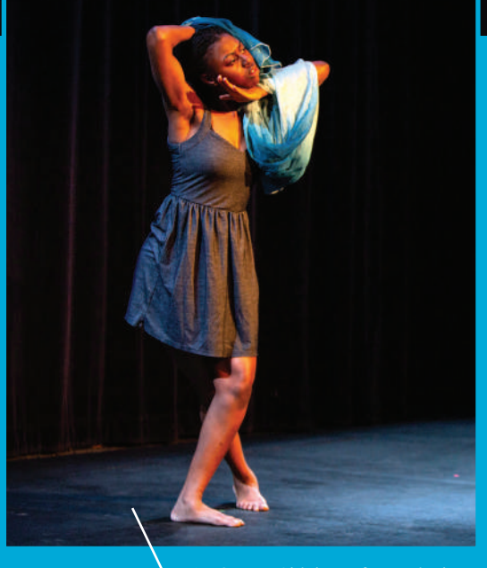
We Gon Be Alright performer in the Engineered Air Theatre