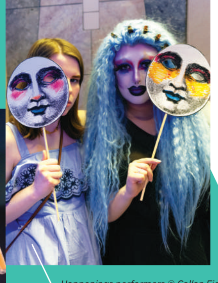
Happenings performers