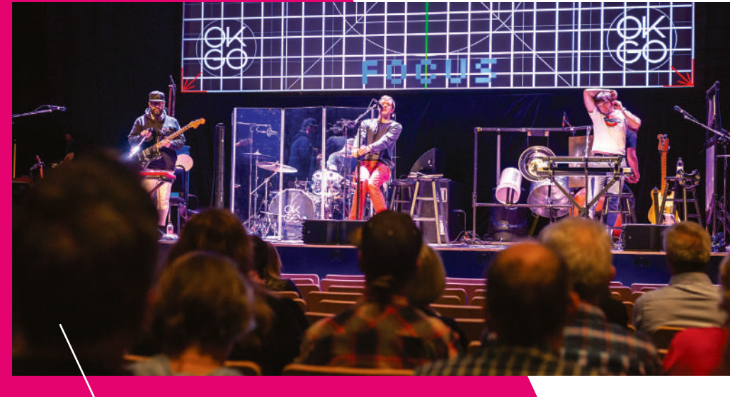
Founders Circle members enjoying a rehearsal and Q&A with OK Go

Through the generosity of the corporations, foundations, and governments, as well as the individuals who choose to donate or join our Explorers Circle or Founders Circle membership programs, Arts Commons is able to continue to be a key contributor to the social, economic, cultural, and intellectual life and wellbeing of our citizens and visitors.