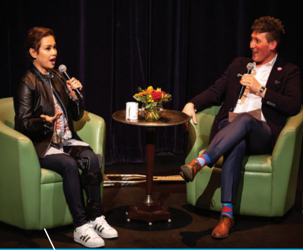
Conversations with Lea Salonga at the Engineered Air Theatre

Habib Koité, Bassekou Kouyate & Ladysmith Black Mambazo perform at the Jack Singer Concert Hall