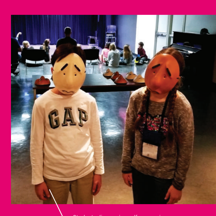
Students discovering self-expression with masks